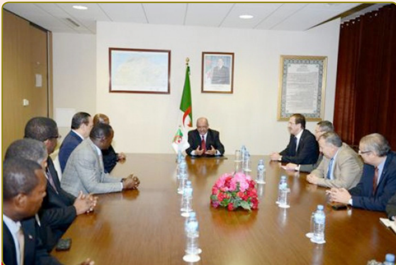
Delegation of the African Olympic Movement received in audience