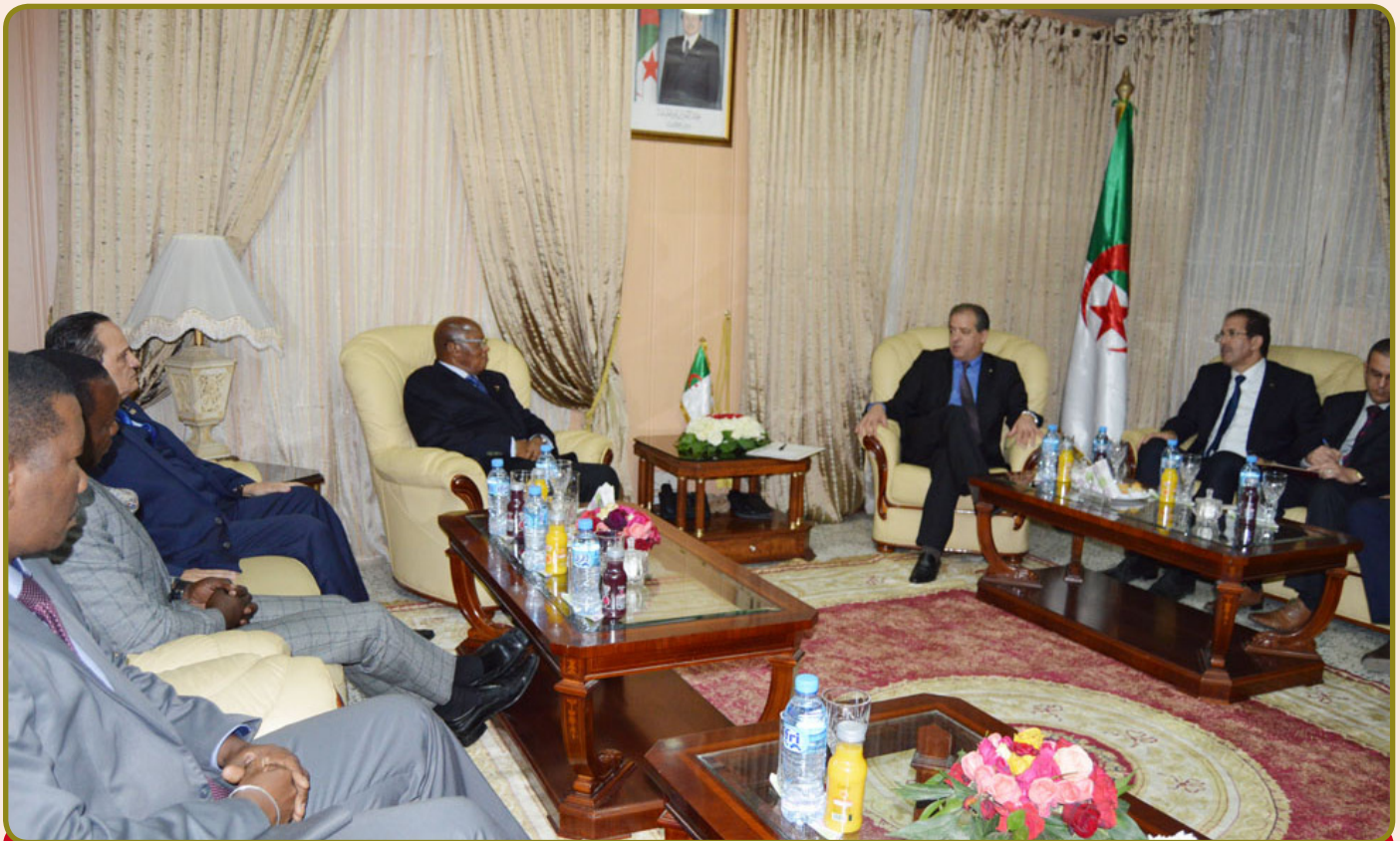
El Hadi Ould Ali receives a delegation of officials of the African Olympic Movement

A lgeria's Minister of Youth and Sports El Hadi Ould Ali received a delegation of representatives of the African Union, the Association of National Olympic Committees of Africa and the Association of African Sports Confederation at the Ministry of Youth and Sports. The delegation led by ANOCA President, Intendant General Lassana Palenfo, also comprised AASC President, General Ahmed Nacer and a representative of the African Union. They were accompanied by COA President, Mustapha Berraf.