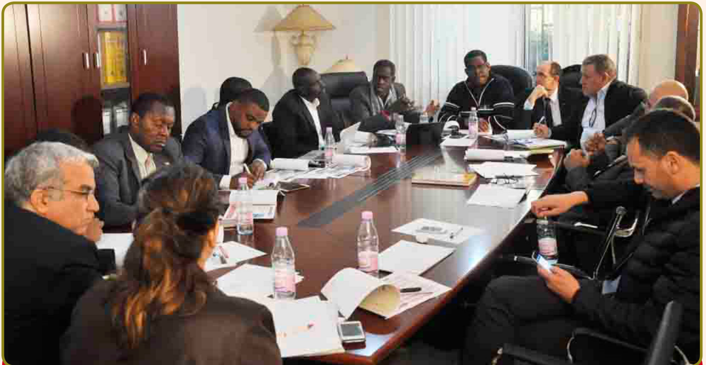
ANOCA meets with local organising committee

W hile in Algiers, the ANOCA delegation held an important working session with the local organising committee of the 3 rd African Youth Games. The aim of the meeting, which took place on 29 November 2016, was to fine tune major organisational aspects of the coming event. The consultative meeting thus examined a number of items, notably transportation, accommodation, accreditations, competition venues, catering, health, the schedule, communication and the stakes in relation to the Youth Olympic Games billed for Buenos Aires, Argentina, in 2018. On this last score, it was decided that the 3 rd African Youth Games will act as qualifiers for the summer Youth Olympic Games.